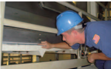
Conveyor belt maintenance

The California Plant is particularly cautious about managing the wastewater it produces in order to minimize the impact of its operations on the environment. In addition to reducing wastewater flows by improving work processes, the facility has been successful in aggressive efforts to reduce contamination of wastewater with pollutants by improving equipment and facilities, for example by changing the material out of which conveyor belts are made to minimize adherence of raw materials.