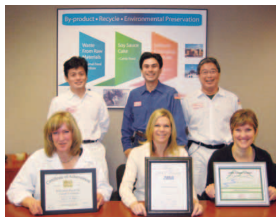
California Plant employees pictured with three certificates recognizing their facility's environmental programs

We've consistently emphasized coexistence with local communities as we've developed our businesses. KFI has sought to play a positive role as a good corporate citizen in the communities in which it is active by pursuing a series of programs designed to help resolve environmental problems and contribute to local employment. As an example of such initiatives, this section introduces environmental measures being undertaken at KFI's California Plant. Residents of California have a particularly pronounced awareness of environmental issues compared to other U.S. states, and KFI's California Plant is actively involved in environmental measures. The company's activities have been praised by the local community, including in the form of awards from Sacramento County, where it is located.