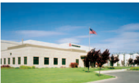
KFI's California Plant