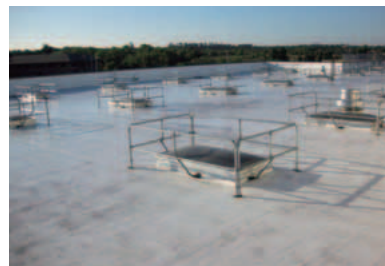
Skylight installed in space gained from a recent expansion

The California Plant has been installing skylights for some time as a means of reducing power usage for lighting. During fiscal 2009, the facility installed skylights in space gained from a recent expansion, bringing the total number of power consumption-reducing skylights to 41. The plant has also sought to reduce power use by installing sensor-activated lighting in areas where work is not performed continuously. Additionally, power and water usage are monitored at all times by a process monitoring system.